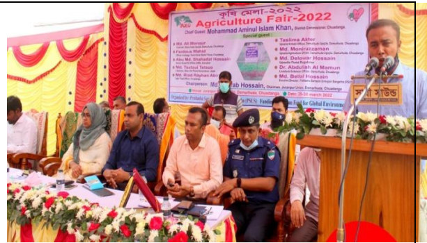
Assistant commissioner of the land said- PSUS deserves thanks to take this kind of initiatives, which is very much effective to adapt climate change effect and protect health from risk.