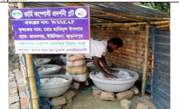
After got Training from PSUS, WSSEAP farmers are producing vermicompost with the assistance of PSUS.