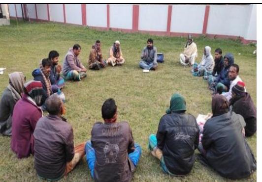
Group meeting with Farmers to reduce Tobacco cultivation