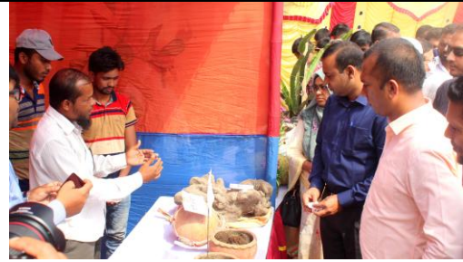
Exhibition plot was visited by guest, where WSSEAP technologies were displayed.