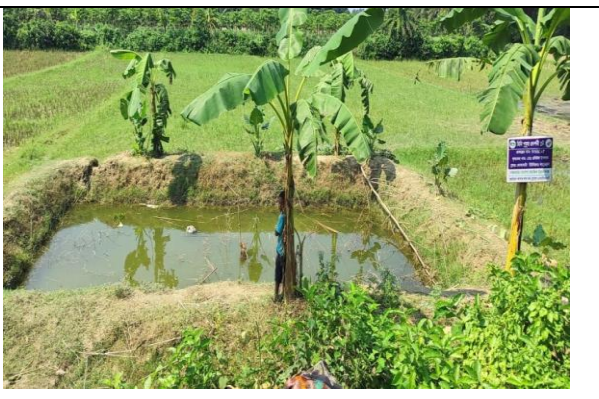
WSSEAP farmers has cultivated small ponds in the corner of land to consume the rainwater for using Seed bed cultivation, Supplementary Irrigation in Aman, fish cultivation and vegetable cultivation surrounding ponds.