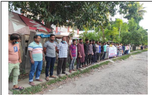
Human Chain ahanist anti-Tobacco campaign