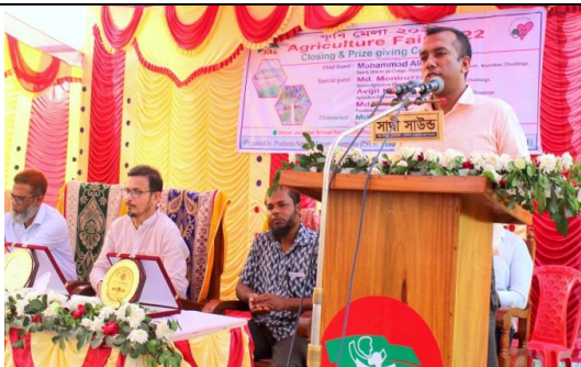
Upozilla Agriculture Officer said that PSUS is implementing this (WSSEAP) project with the concern of Agriculture office and we will cooperate them continuously because they are working for betterment of the farmer.