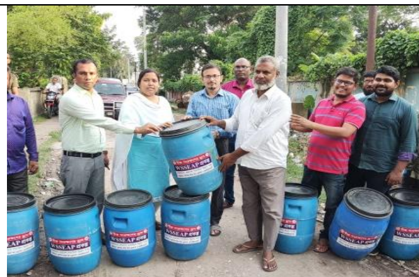
After training on Seed Management, UNO and Upazila Agriculture Officer has distributed Seed drum among the WSSEAP Farmers.