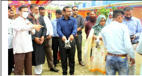
Program was started with the pigeon flying from the Hand of DC, UNO and ED of PSUS in the morning